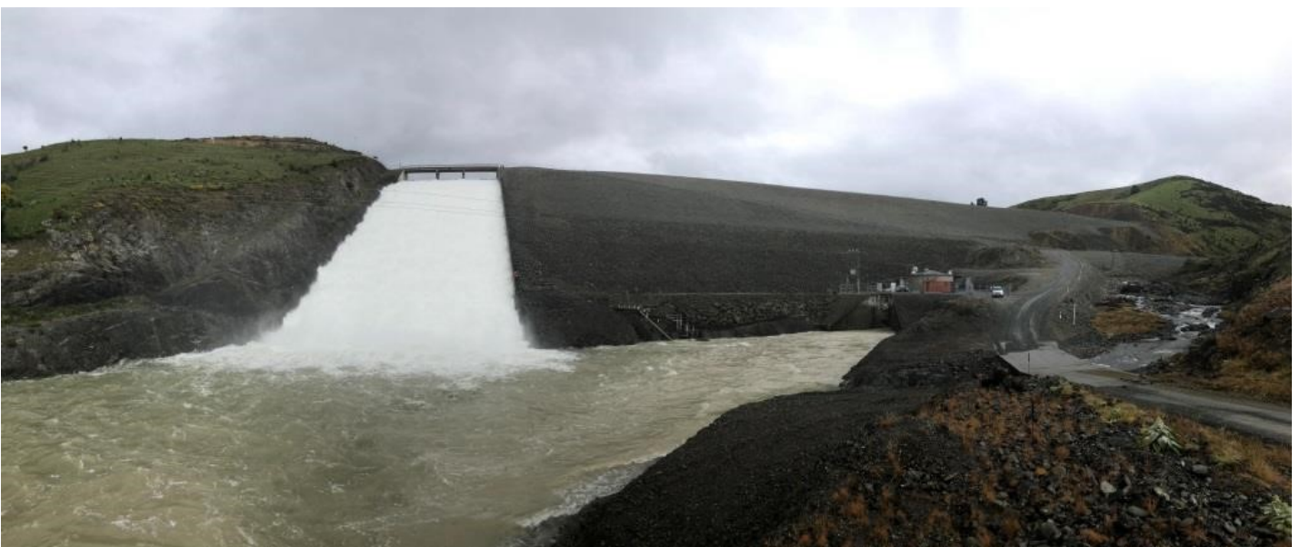
Service spillway in operation in late Nov, spilling approx. 80m 3 /s

Attached separately from Irrigation New Zealand “An efficient irrigation system can save you money.” For more information or to register to take part in the programme contact Irrigation NZ or visit their website www.irrigationnz.co.nz/events-training