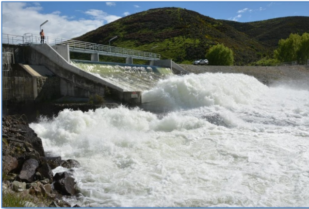
Artificial Fresh (Flushing Flow) Trial – November 2016

As part of the upgrade, we have installed a walkway across the spillway which now allows safe access for our staff and contractors over to the equipment buildings on the other side. Up until now, this access was only possible by walking across the spillway crest or down and up the spillway face – both tricky and unnecessarily hazardous, and impossible if the spillway was operating. We have also installed new security fence to restrict entry