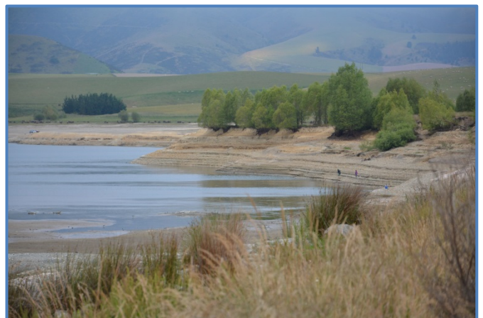
These photos were taken before Xmas with the lake at 383m – it is now 1.7m lower